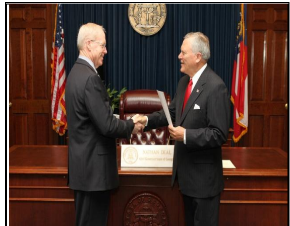
A hand shake seals the deal